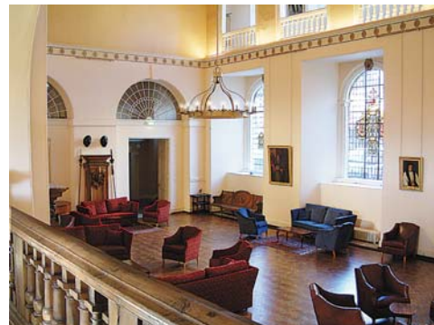
The Castle contains numerous invaluable examples of historic design including this Grinling Gibbons staircase