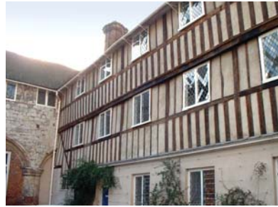
Accommodation is available in the famous Wykeham Tudor wing

Offering state-of-the-art, broadcast quality connection, our system will allow you to video link using existing corporate in-company facilities or through our network of literally thousands of 'meeting rooms' around the world, at a time to suit you and at an affordable cost. We can even provide simultaneous, multi-site connection.